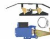
Otis Type Retaining Cam