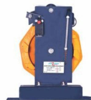
OSG MRL (200) S.M TOP PULLEY