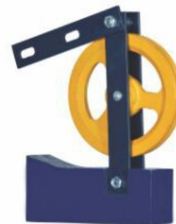
OSG MRL (200) BOTTOM PULLEY