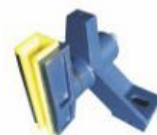
Exel Type Car Shoe