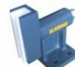
Otis Type Car Shoe