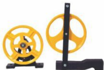
OSG Set (Single Groove)