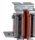
SM Guide Shoe