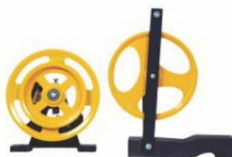
OSG Set (Double Groove)